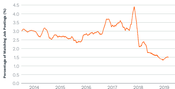
.Net Job Posting Trend

The chart speaks for itself: a decline in .Net positions over the years.